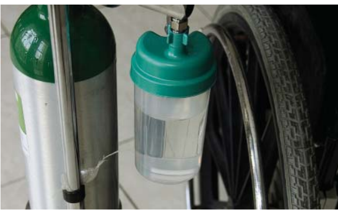
The hidden fuel load in a hospital is significant. Consider the distribution of bottled oxygen throughout the facility.